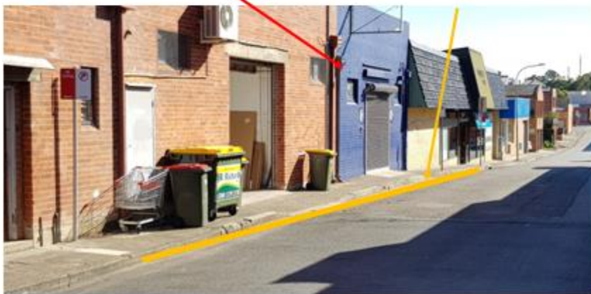
Proposed Loading Zone