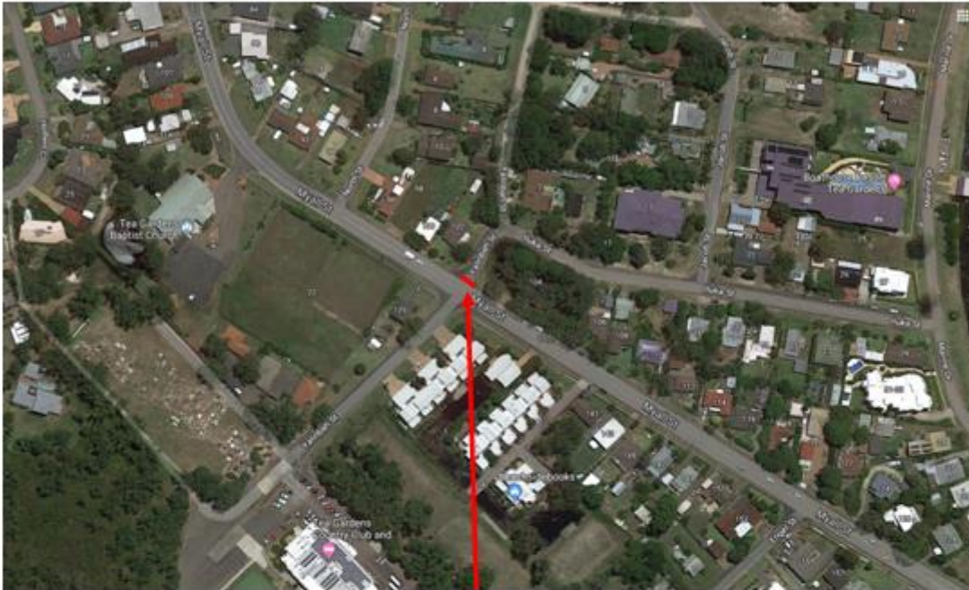
Proposed Give way sign and Line