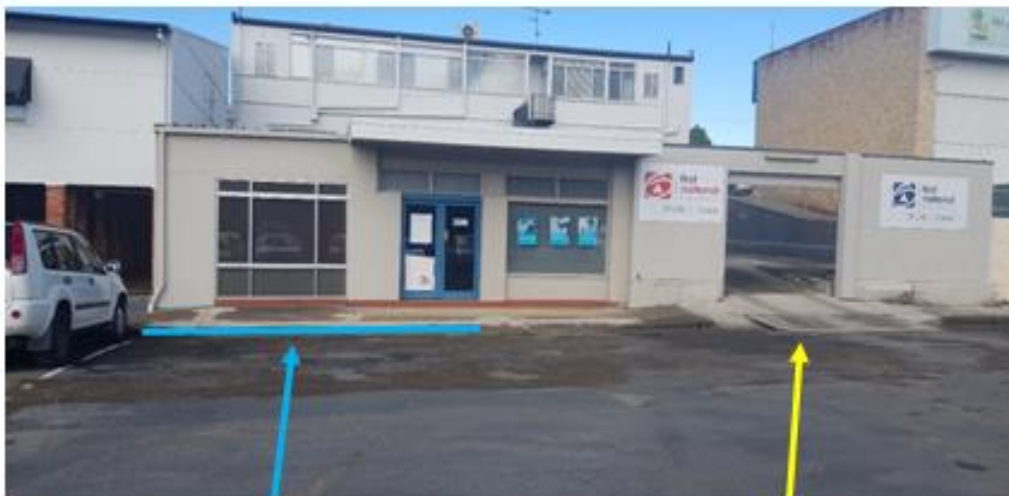
Proposed Accessible Parking Space