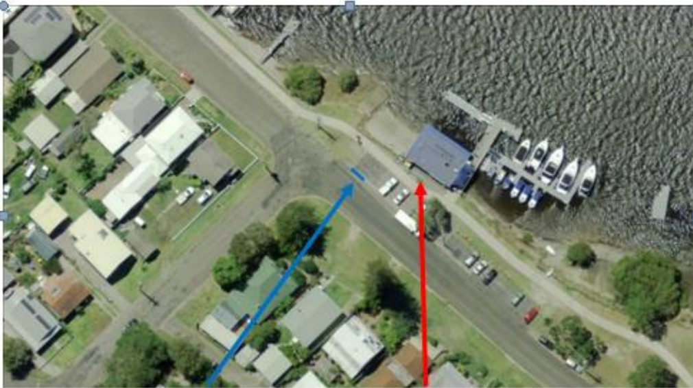
Location of Proposed Disabled Parking Space Boat Shed Restaurant

B: Photograph of Proposed Disabled Parking Space