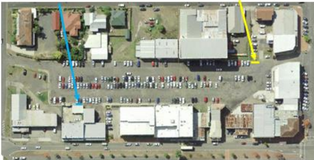
Disabled Parking Spaces