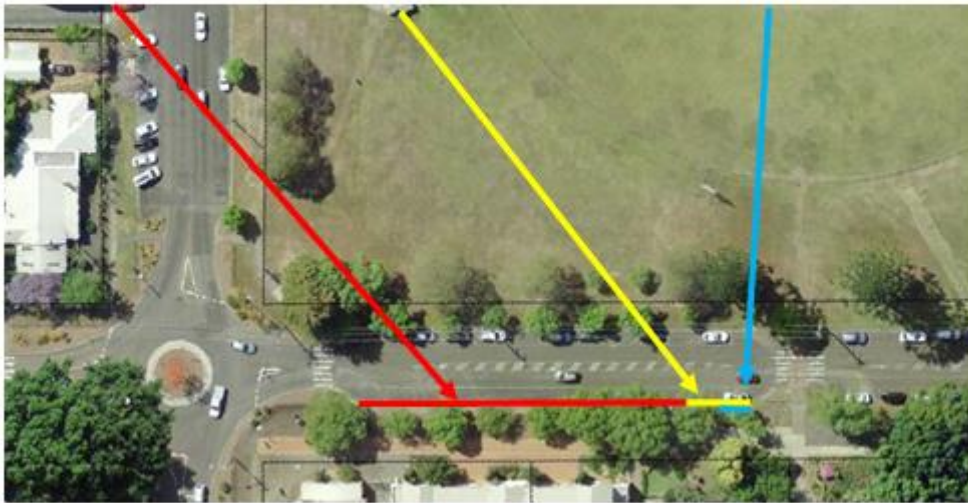
B: Picture of Proposed Disabled Parking Space

Bus Zone Parallel Parking Proposed Disabled Parking Space