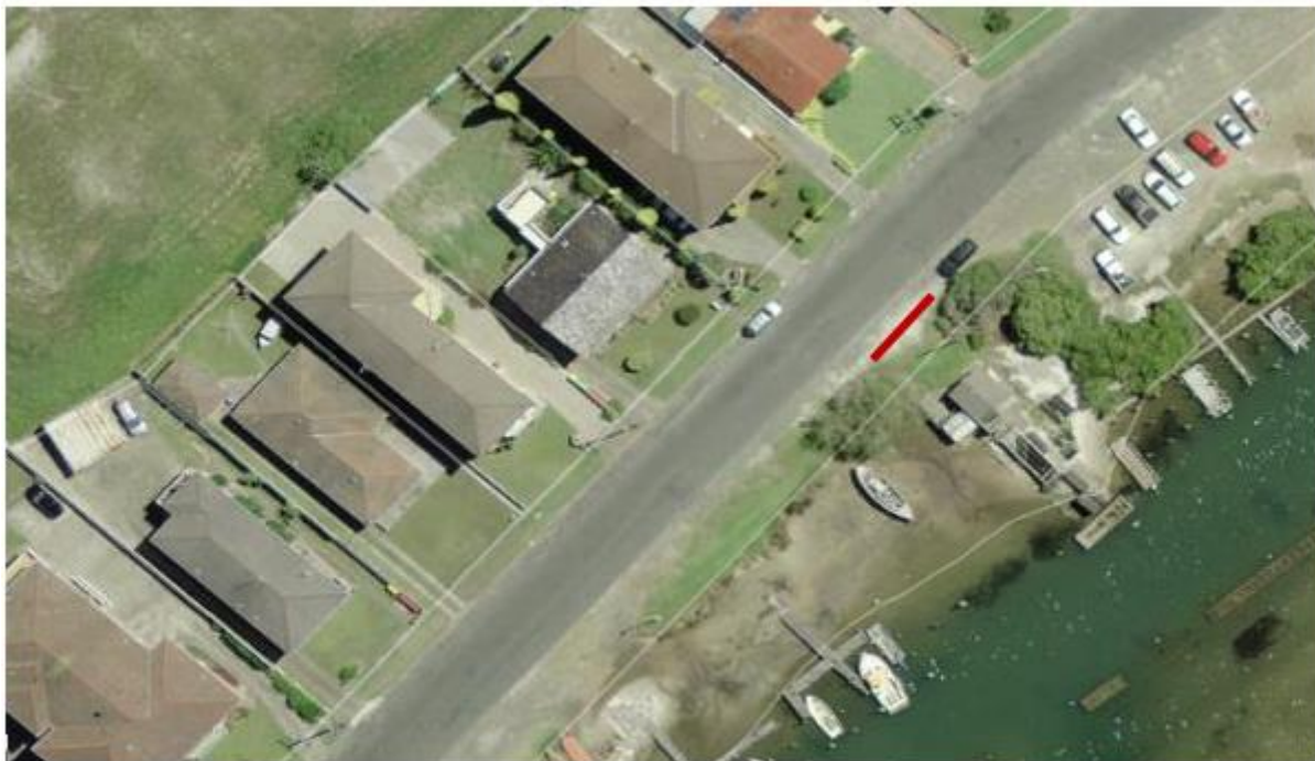
Proposed No Stopping Zone across front boundary of Lot 3 Point Road, Tuncurry.