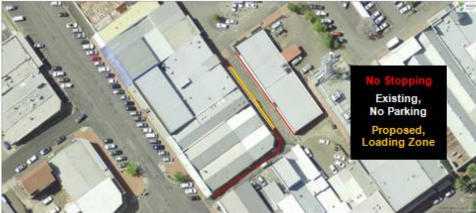
Proposed Location of Loading Zone