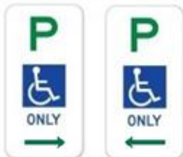
Signs and Pavement markings to designate Disabled Parking Space and Shared Area access