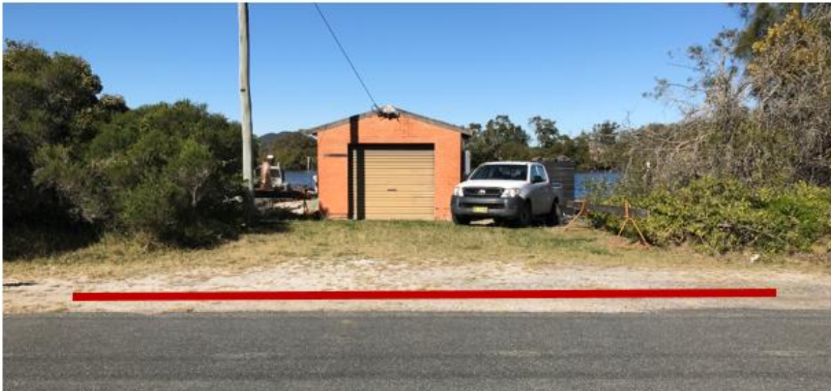
Proposed No Stopping zone across front boundary of Lot 3 Point Road, Tuncurry.