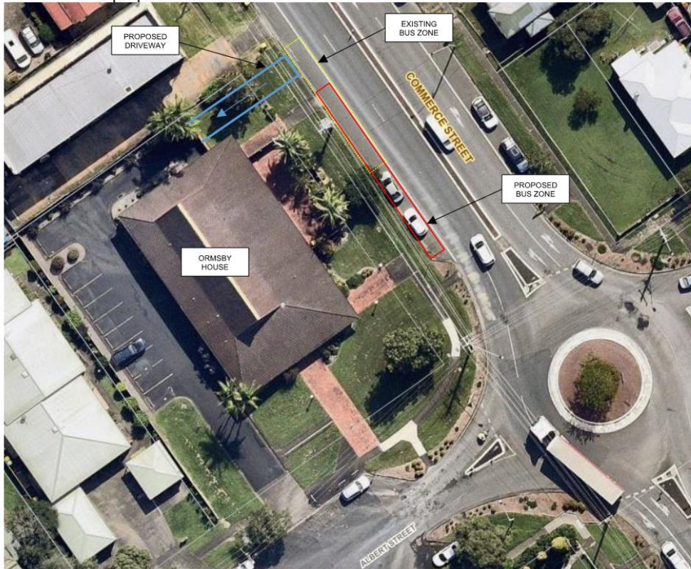
A: Location of proposed Bus Zone